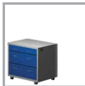
Cabinets & Drawers